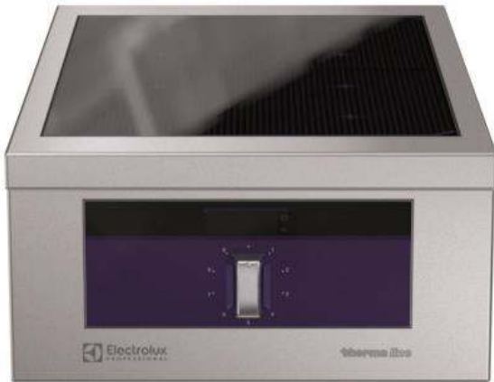
588686 (MBRABFOBO) Electric Warming Plate, 1-sided operated with backsplash